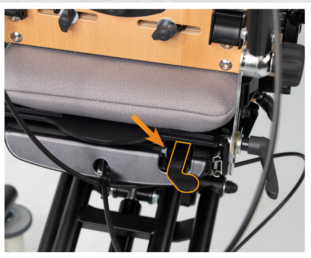
Unique seat depth adjustment

The Nele activity chair is also available with outdoor frame. 12" pneumatic driving wheels and 6" solid rubber castor wheels make it the perfect choice for outdoor activities.