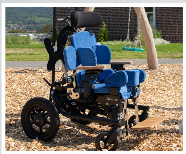
Nele with outdoor frame

The Nele activity chair is also available with outdoor frame. 12" pneumatic driving wheels and 6" solid rubber castor wheels make it the perfect choice for outdoor activities.